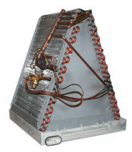
A thin build-up of pollutants on your system's indoor coil, just two-thousandths of an inch thick, can reduce airflow by as much as nine percent*. Carrier's UV Light can clean the coil and virtually eliminate additional build-up.

Air Cleaners improve indoor air quality by trapping airborne pollutants. The Carrier UV Light actually destroys microbial growth on the coil. The Carrier UV Light unit is mounted inside your system, near the indoor coil, where fungus and microbes may grow. The UV Light works to clean the coil and prevent the growth of fungus on and around the coil by destroying the DNA of the fungus to kill or deactivate it. As a result, when the Carrier UV Light is used in conjunction with a Carrier high-efficiency air cleaner, the conditioned air circulating through your home is cleaner and fresher, while the inside of your system stays cleaner for maximum efficiency and performance.